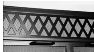
CLOCKWISE FROM TOP LEFT: Standard Mesh, Pull Down Bottom Louver*, Navaho, Diamond and Leaf Scroll louver styles.

* This option is only available for a Direct-Vent fireplace.