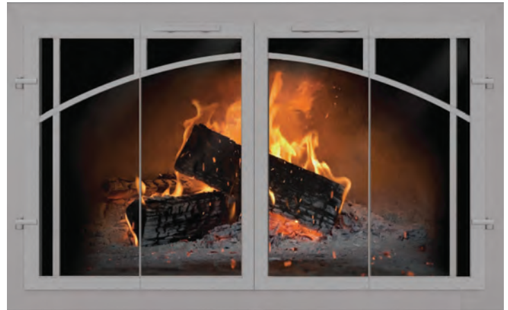
Shown in Textured Grey Iron.

The Normandy Deluxe is a 2" aluminum channel frame enclosure. It is available as an inside or overlap fit. The maximum overlap for this frame is 3/4" for the top and 1 1/2" on the sides with a mesh curtain.