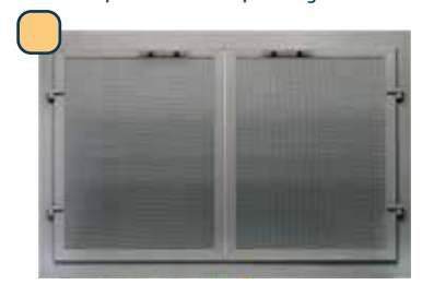
Twin Panel Mesh Doors use a .125" thick 25-Gauge steel mesh instead of glass.