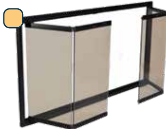
ES2 2 Bi-fold doors with 4 tempered glass panels