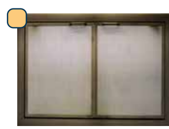
Twin Panel Mesh Door A .125" thick 25-Gauge steel mesh instead of glass