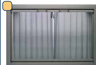
Mesh Curtains use a 19-Gauge steel wire woven into two 24" curtain panels +$179.00