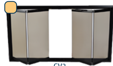
CV2 2 bi-fold doors with 4 tempered glass panels