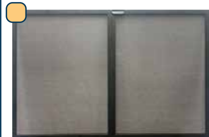
Inner Mesh Doors sit inside your Glass Doors and use a .125" thick 25-Gauge steel mesh instead of glass +$199.00