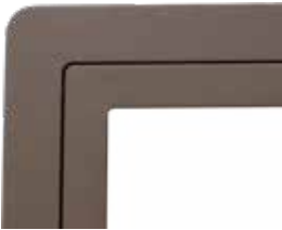
Top Rounded Frame & Door Channel