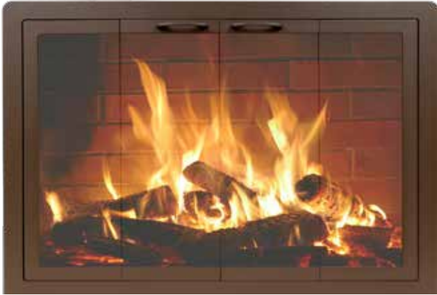
Shown in Textured Chestnut