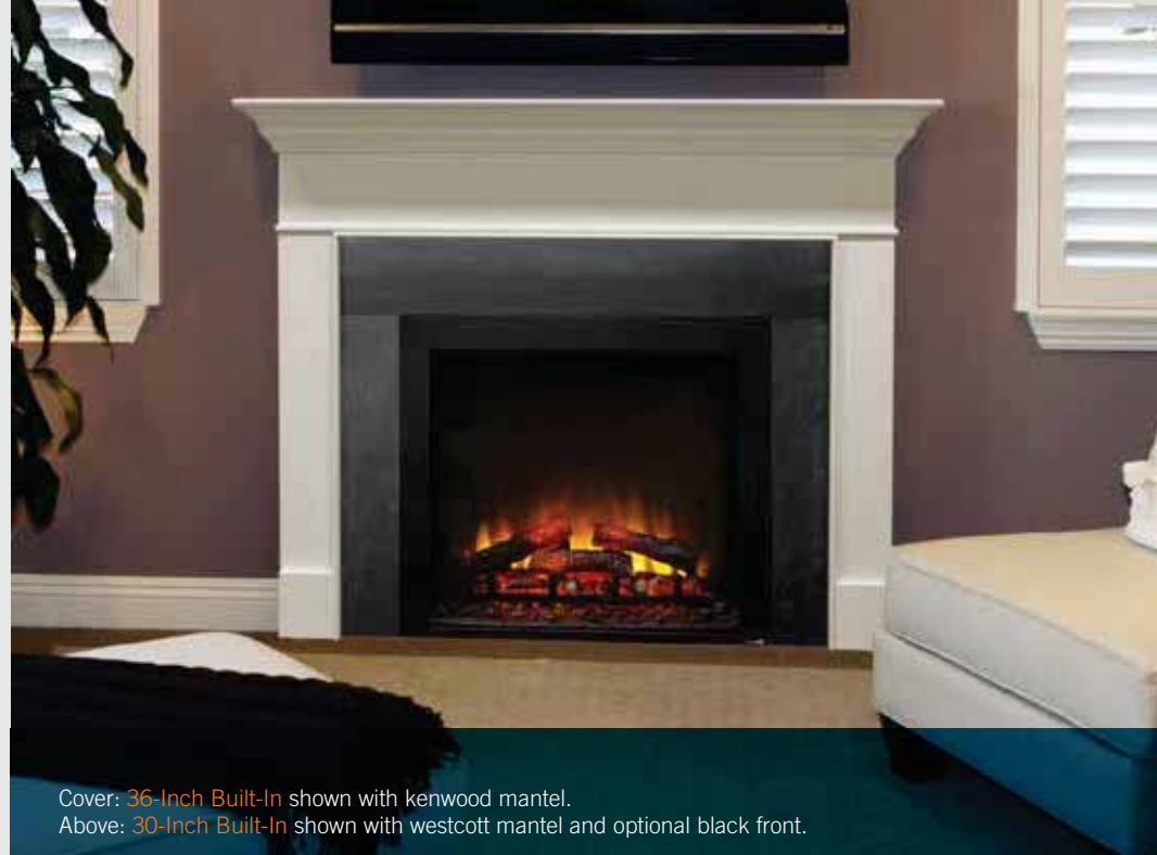
Cover: 36-Inch Built-In shown with kenwood mantel. Above: 30-Inch Built-In shown with westcott mantel and optional black front.