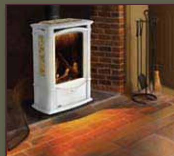
Built-in Night Light™