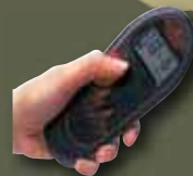
Optional Remote Control