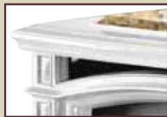
Porcelain Winter Frost