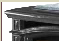
Metallic Black Finish