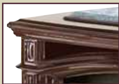
Porcelain Majolica Brown

Optional fluted glass adds a touch of distinction to the artistically design registered® door