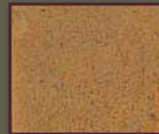
Decorative Brick Stone Panels