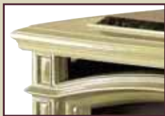
Porcelain Summer Moss