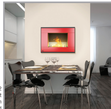
Right: WMFE2 Square Wall Mount Ethanol Fireplace shown with Red surround