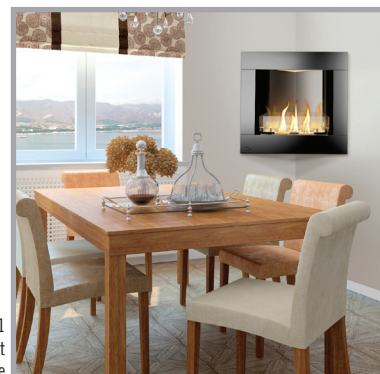
Right and Cover: WMFE1 Corner Wall Mount Ethanol Fireplace

Measurements are to be used as a guide only. Please consult your installation manual for updated and precise measurements before proceeding to install or frame your Napoleon® Fireplace. Tested in Canada and the U.S. CSA approved.