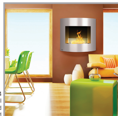
Right: WMFE4 Convex Wall Mount Ethanol Fireplace shown with Brushed Stainless Steel surround

Consult your owner's manual for complete installation instructions, accurate framing dimensions and proper clearances to combustible material. Check all local and national building code regulations. All specifications are subject to change without prior notice due to on-going product improvements. Products may not be exactly as shown. Napoleon® is a registered trademark of Wolf Steel Ltd. © Wolf Steel Ltd.