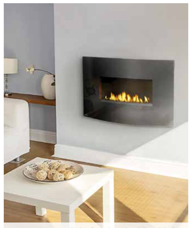
The Plazmafire 24 shown with standard curved glass front