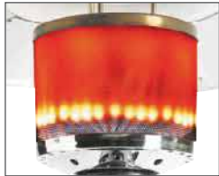
Durable, High Efficiency Burner

This natural gas model of the Cast Aluminum series is sleek and slender with a sturdy base, taking up minimal space in your outdoor living area. Elaborate details make an impressive feature in your outdoor décor and with a cast aluminum body, quality is not sacrificed. A 20' diameter of radiant heat provides an efficient heating source for your outdoor living area.