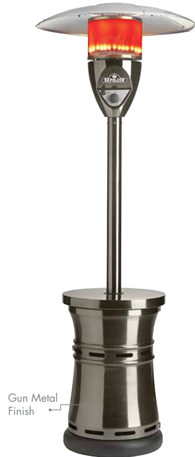
Gun Metal Finish