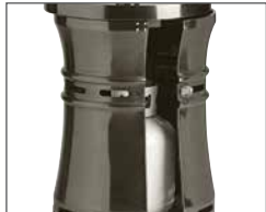
Propane Access Door

Sleek and smooth, the Gun Metal patio heater is simple but impressive in design and suits any outdoor living environment. A 20' diameter of radiant heat provides a comfortable and efficient heating source for your outdoor living area so you and your guests can enjoy yourselves comfortably. Available in propane only, this model features a charming propane compartment with swing open door for tank access and doubles as a convenient and sturdy table top. Gather and enjoy.