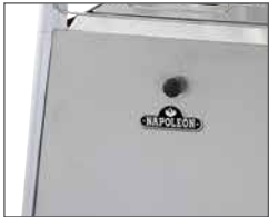
Propane Access Door

The Napoleon® Bellagio™ Patio Torch provides cozy mood lighting from an attractive single, luminous four foot flame. The unique design, which includes a protective SAFEGUARD™ screen with a 360° view of the flame, meets the demands of today's modern lifestyle and is a perfect accent for pools, decks and outdoor rooms. An inspiring mix of art and design that brings your outdoor living space to life. Optional natural gas conversion kit available.