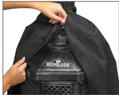
Optional Heavy Duty Cover

If your style is classic and ornate, then the Cast Aluminum patio heater series is the perfect fit for your outdoor space. Its cast aluminum body offers strength and durability and its ornamental design and rich pewter look add a touch of elegance and sophistication. A 20' diameter of radiant heat provides an efficient heating source for your outdoor living area. Entertain comfortably around your space with room to spare. It is equipped with pilot ignition and heat control. This propane model features a decorative tank enclosure.