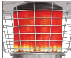
Durable, High Efficiency Burner