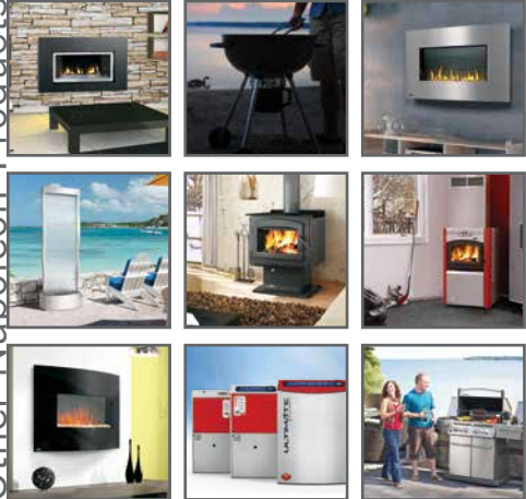
Fireplace Inserts • Charcoal Grills • Gas Fireplaces • Waterfalls • Wood Stoves Hybrid Furnaces • Electric Fireplaces • Heating & Cooling • Gourmet Grills