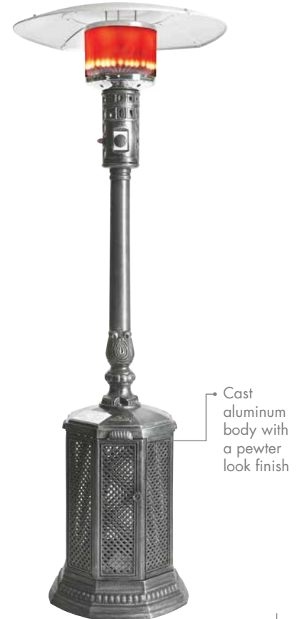
Cast aluminum body with a pewter look finish