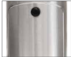
Easy Access Door