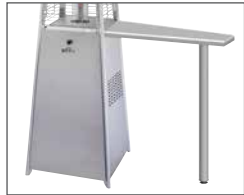
Optional Side Shelf and Bar Table