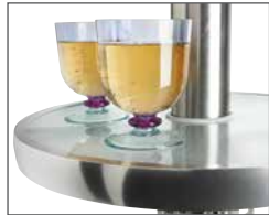
Optional Post Mount Table