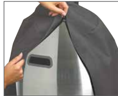
Optional Heavy Duty Cover