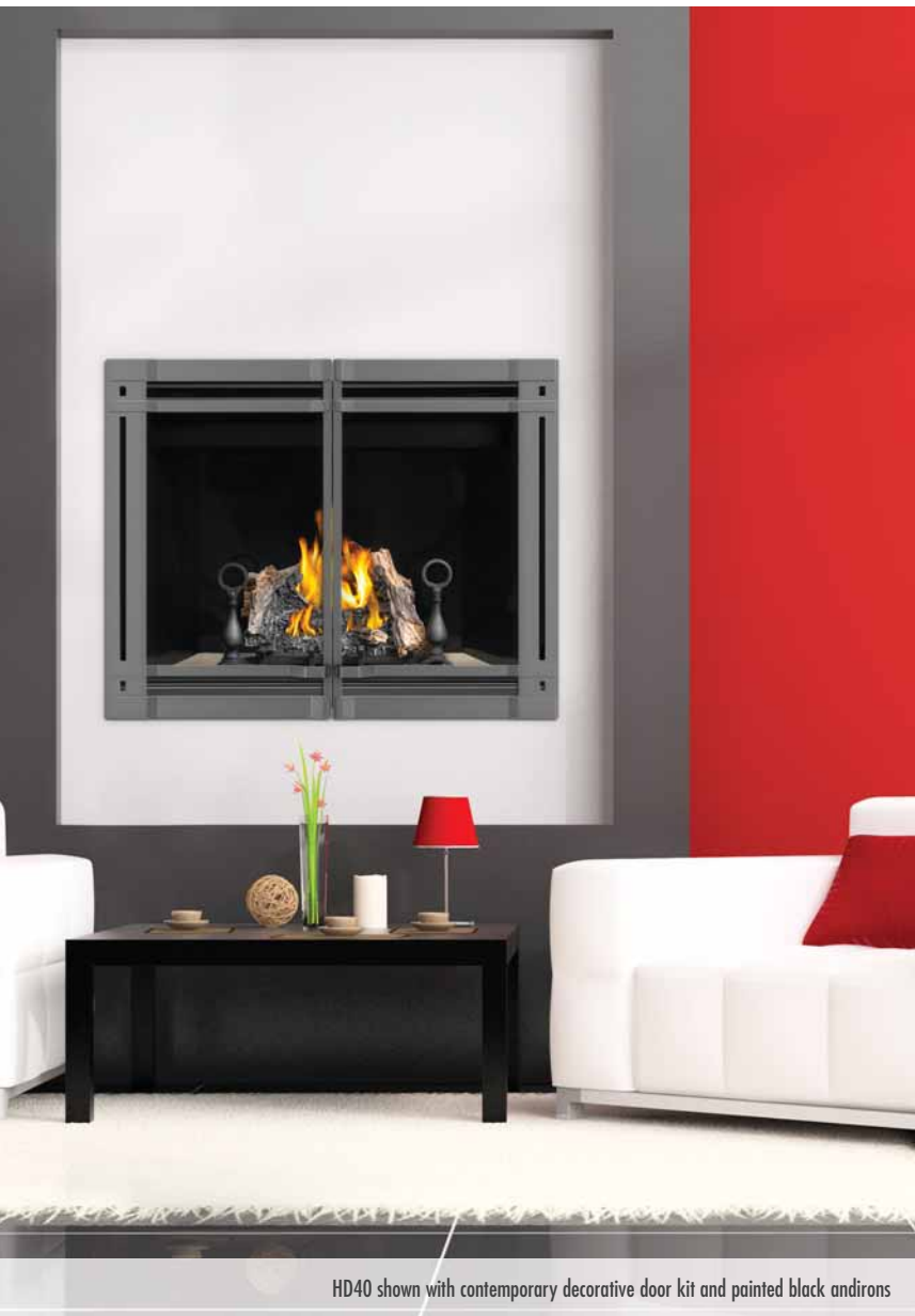
HD40 shown with contemporary decorative door kit and painted black andirons