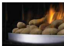
River Rock Media Tray with Satin Chrome Decorative Fender