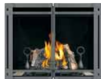
Contemporary Decorative Door Kit with Operable Screen Doors