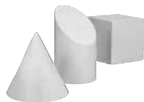
GEO Shapes Media Enhancement Kit