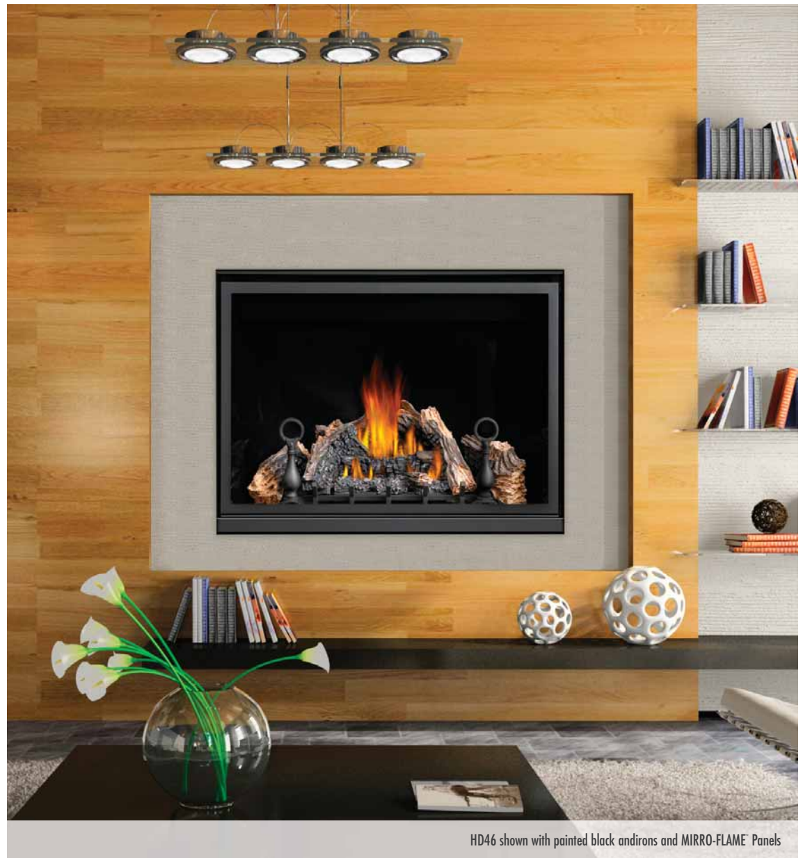
HD46 shown with painted black andirons and MIRRO-FLAME Panels