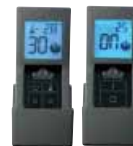
F45 & F60 Remote Controls On/off or Modulating