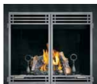
Modern Faceplate with Operable Screen Doors