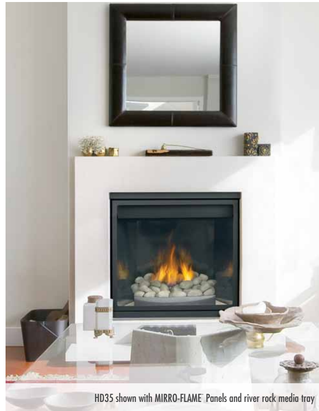
HD35 shown with MIRRO-FLAME® Panels and river rock media tray

For more detailed specifications on these units, see page 40 & 41