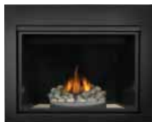
Four-Sided Frames Three Colour Options*