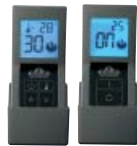
F45 & F60 Remote Controls On/off or modulating