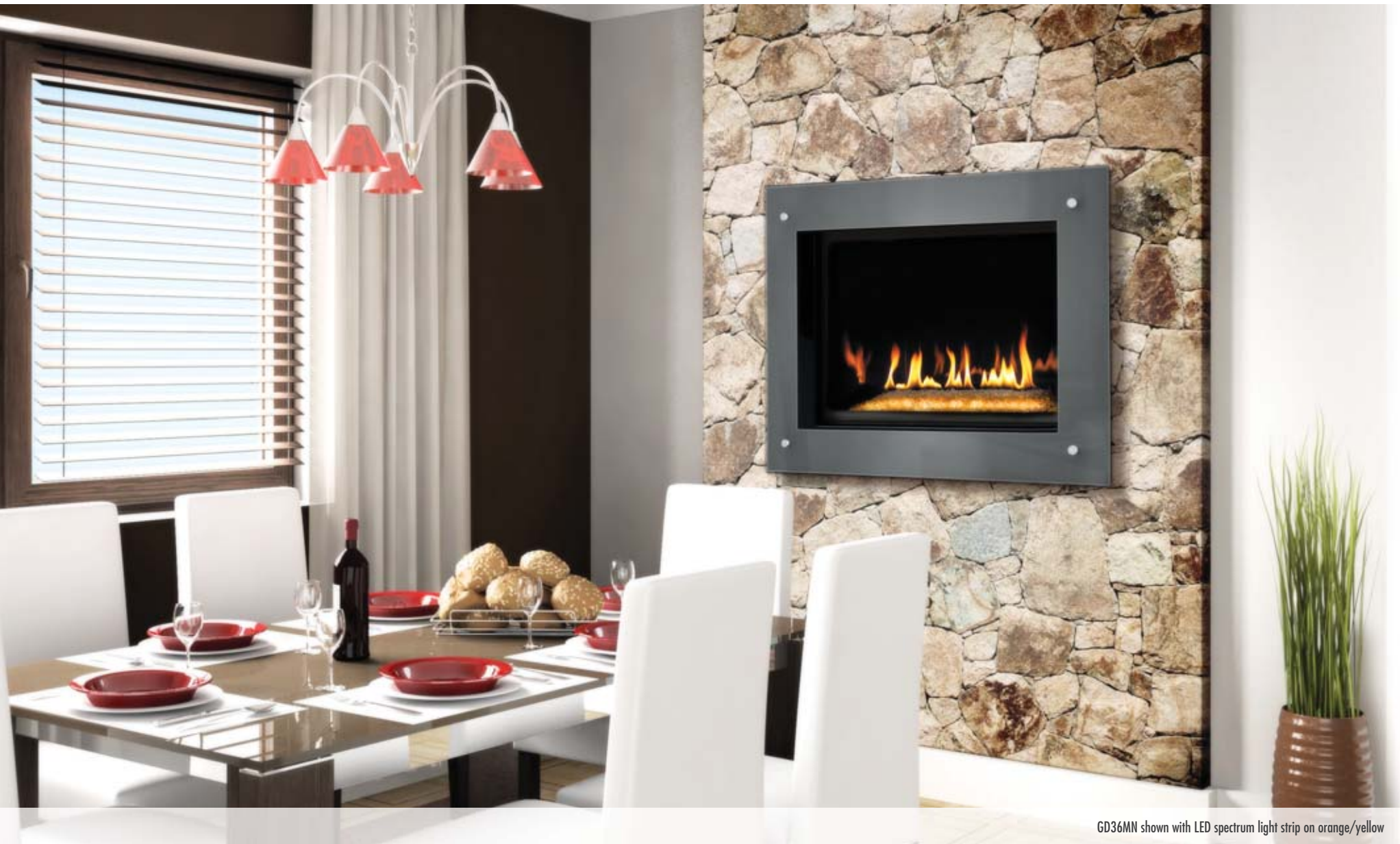
GD36MN shown with LED spectrum light strip on orange/yellow