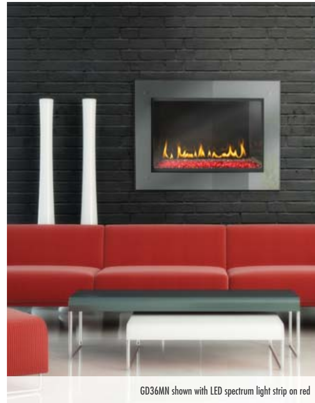
GD36MN shown with LED spectrum light strip on red