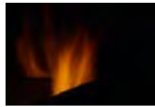
Reflective Black Glass (single-sided only)