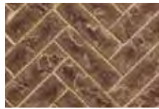
Tavern Brown Herringbone (single-sided only)