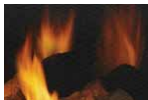
Reflective black glass