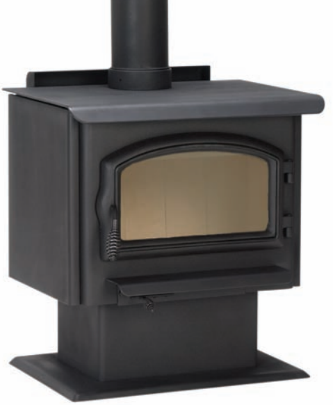
SSW30FTPB Wood Burning Steel Stove shown in standard black.