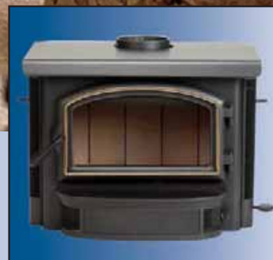
SSI30 wood burning steel insert shown in standard black with optional gold door bezel.