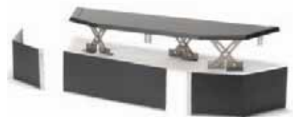
Optional adjustable hearth (exploded view).