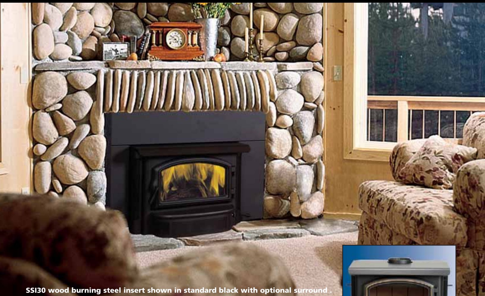
SSI30 wood burning steel insert shown in standard black with optional surround .