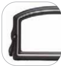
Optional nickel door bezel.