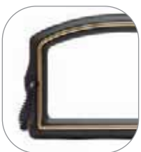
Optional gold door bezel.

Lower Air Inlet – metered air is injected at base of primary combustion zone to promote complete combustion of fuel.