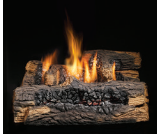
LOGF18 Log Set