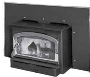
Performer™ C210AGL with Arch Door and Blower

Performer™ Model C210GL insert is safety listed with the following agency: