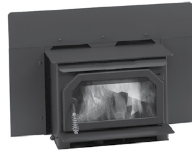
Performer™ C210TGL with Traditional Door