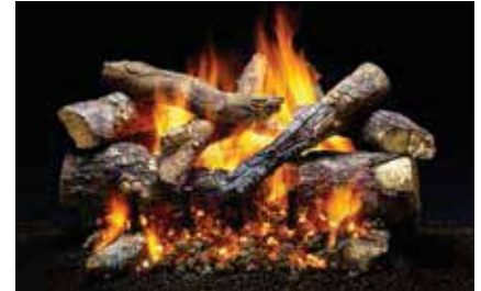
Fireside Gas Logs