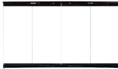
Bi-fold Glass Doors