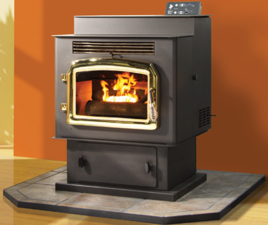
Shown with optional log set

Door and Louvers Available in: Gold Polished Nickel Classic Black