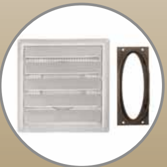
FRESH AIR KIT