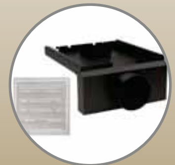
FRESH AIR KIT