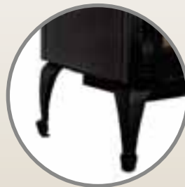
BLACK QUEEN ANNE