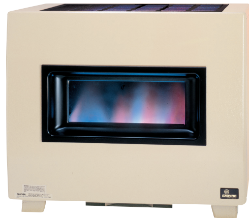
RH-50B Visual Flame Heater