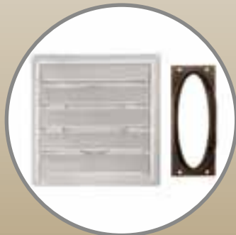
FRESH AIR KIT