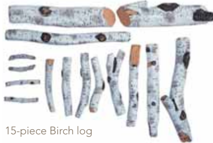
15-piece Birch log