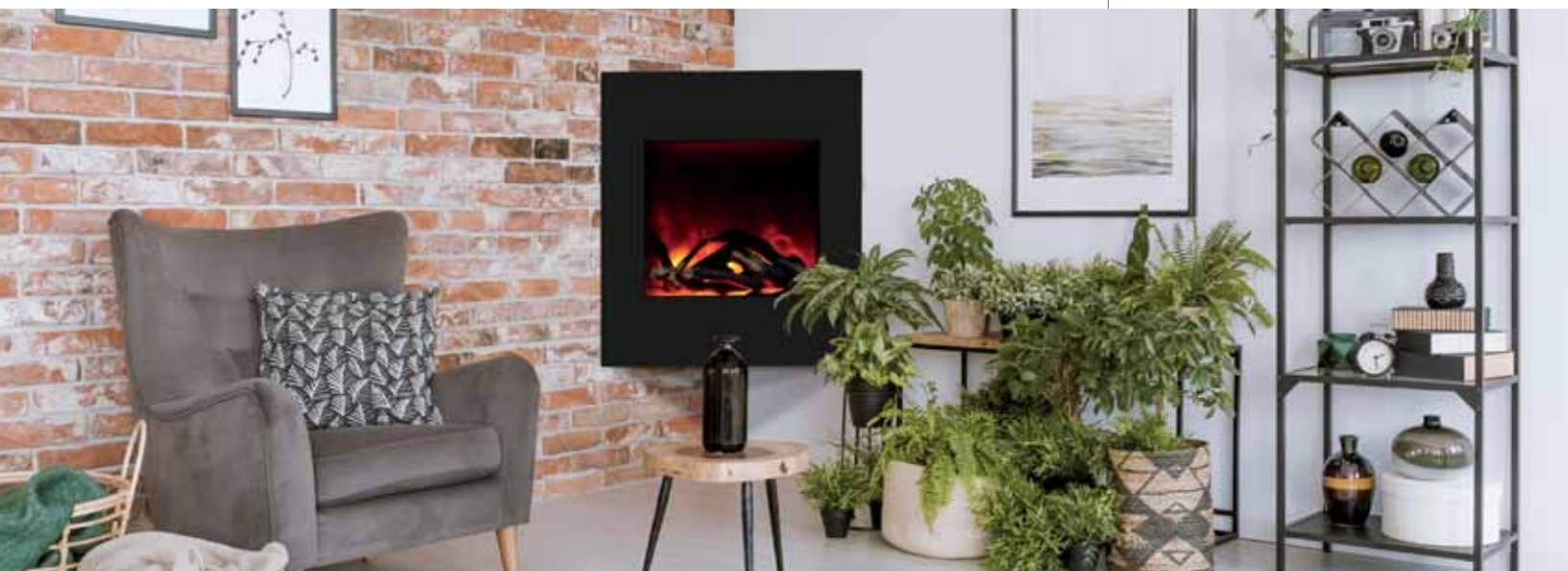
WM-BI-2428-VLR-BG Curved Surround