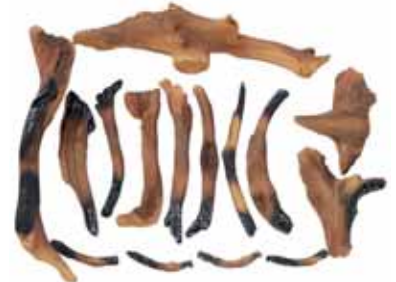
15-piece Drift log