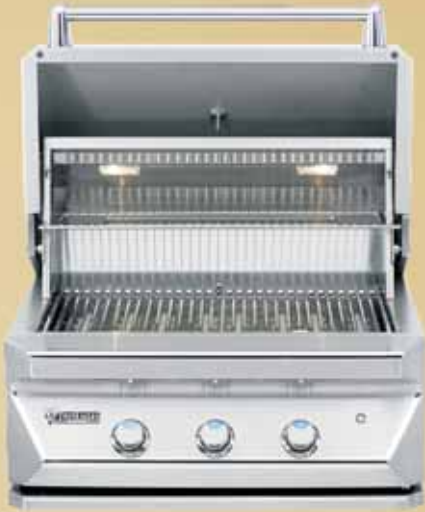
TEBQ30G 30" Outdoor Gas Grill