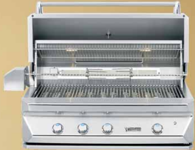
TEBQ42R 42" Outdoor Gas Grill